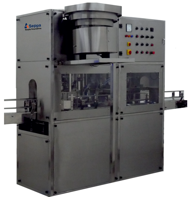
Model : Evats1000 Speed : 6-10 BPM MOC : SS 304