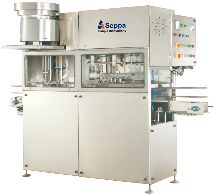
Model : Evats1000 Speed : 6-10 BPM MOC : MS & SS 304 (Contact Parts)

Optional Features : Shrink Labeller is provided on the output conveyor